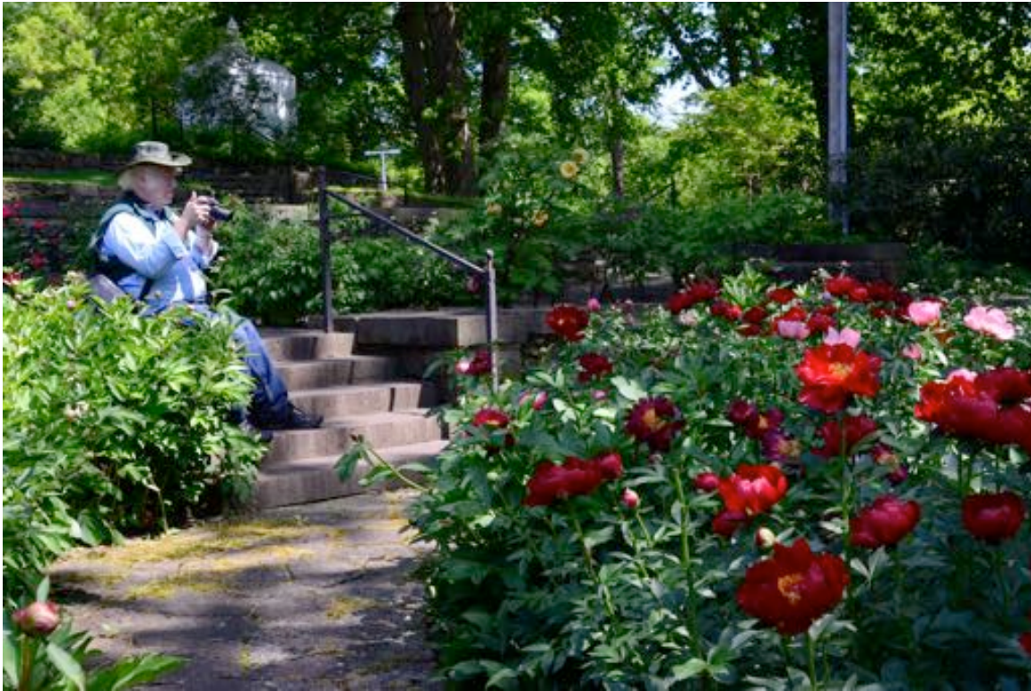
At Winterthur (above), the peonies stood out. Jenkins Arboretum (right) had food stations all over the garden.