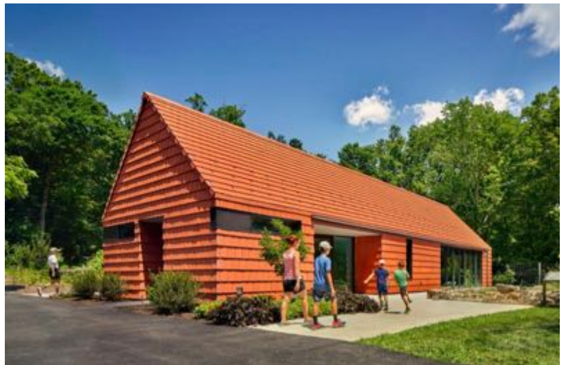
Tyler's Edible Garden Building, site of the October 15 meeting. The cladding is terra cotta tiles. (Photo: Digsau architects.)

The luncheon event will also incorporate the hoary Greater Philadelphia plant exchange known as Rhododendron Roulette. Guests are asked to bring a plant for each reservation – rhododendrons and