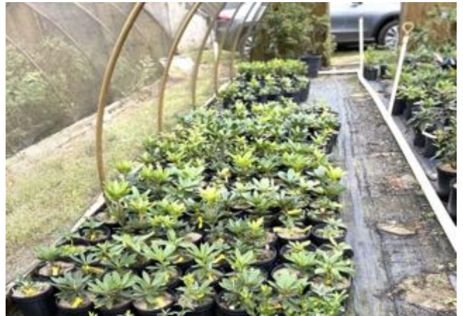
Year-old propagations for the test garden.