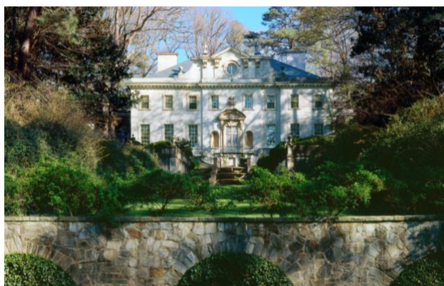
Swan House in the Atlanta History Center

The Atlanta History Center has a rhododendron and azalea dell originally developed by the Azalea Chapter ARS. Piedmont Park began as a fairground for expositions in 1887.