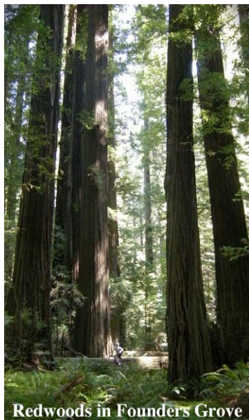
Redwoods in Founders Grove