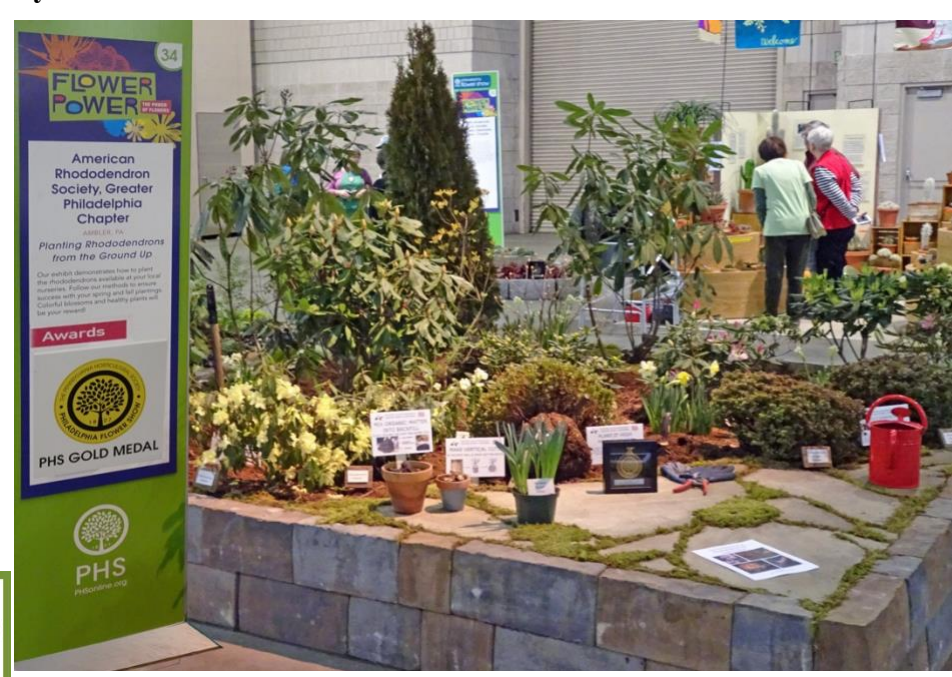
Congratulations to the ARS Greater Philadelphia Chapter for winning a Gold Medal at the 2019 Philadelphia Flower Show

Where every purchase benefits the American Rhododendron Society