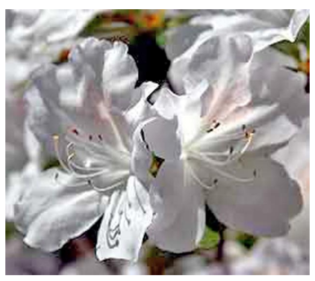
Evergreen Azalea: 'Treasure'

Flower light purple at edges shading lighter in throat, no markings, openly funnel-shaped, 1¾" across. Ball-shaped truss has 4-6 flowers. Blooms early midseason. Leaves elliptic, acute apex, cuneate base, convex, 2¾" to 3½" long, semi-glossy, moderate olive green. Open growth habit. Grows to a typical height of 5 ft. in 10 years. Plant and bud hardy to -15 °F (-26°C). Hybridized by Rhein.