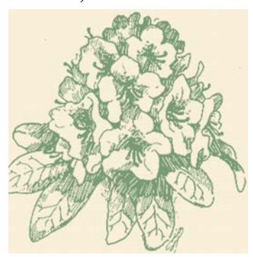
NEWSLETTER March / April 2019

Valley Forge Chapter 14 Northwoods Rd Radnor, PA 19087