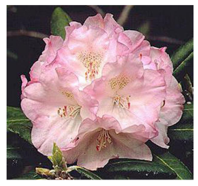
Elepidote Rhododendron: 'Ken Janeck'

The Rhododendrons of the Year for all 8 regions are announced in the JARS each year. Those selected for the Mid-Atlantic Region in 2019 are: