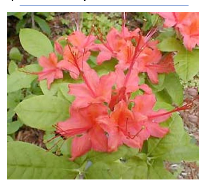
Deciduous Azalea: R. cumberlandense

Rcv. Ken Janeck is one of the best forms of R. degronianum ssp. yakushimanum ) with appealing foliage and richly-colored pink flowers. Flowers are funnel-shaped, 2½" across, held in trusses with 13 to 17 flowers. Blooms midseason. Leaves oblanceolate, re-curved, dark green with thick indumentum beneath. Compact, mounding plant habit. Grows twice as wide as high. Height: about 4 ft. in 10 years. Cold hardy to -15°F (-26°C). Selection received an Award of Excellence (1969). There is debate as to whether the plant is a variety of the species or is a hybrid containing R. smirnowii or another species. Selected by Janeck.