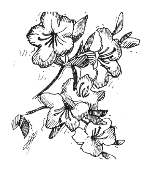
2019 Plant Sale

The Valley Forge Chapter of the American Rhododendron Society always offers exceptional plants, many not in the trade.