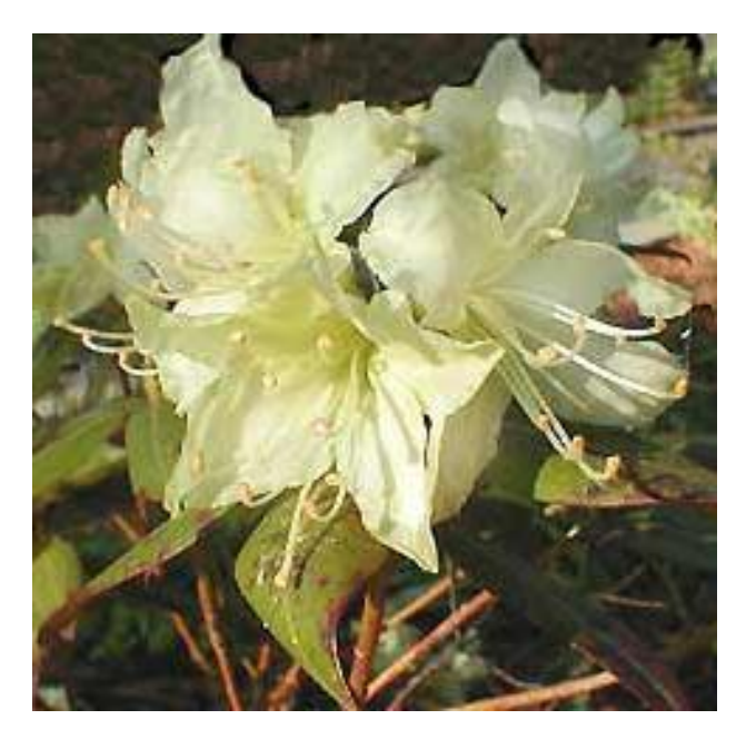
Lepidote Rhododendron: R. keiskei var. keiskei'

The flower is pale yellow, widely funnel shaped, 1½" - 2" across. Inflorescence 2-6 flowered. It blooms early midseason. The leaves are lanceolate to narrowly elliptic, acute apex, cuneate or rounded base, 1½" to 3" long, bronze-colored when young. It has open growth habit. It grows to a typical height of 2 ft. in 10 years. It is plant and bud hardy to 0°F (-18°C). It is native to Japan (widely distributed, Honshu to Yakushima).