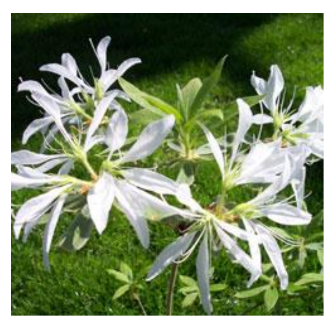
Evergreen Azalea: 'Wagner's White Spider'

The flower is pale yellow, widely funnel shaped, 1½" - 2" across. Inflorescence 2-6 flowered. It blooms early midseason. The leaves are lanceolate to narrowly elliptic, acute apex, cuneate or rounded base, 1½" to 3" long, bronze-colored when young. It has open growth habit. It grows to a typical height of 2 ft. in 10 years. It is plant and bud hardy to 0°F (-18°C). It is native to Japan (widely distributed, Honshu to Yakushima).