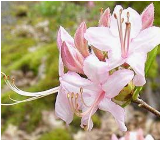
Deciduous Azalea: R. periclymenoides

The flowers are light orange-yellow with 0.25" edging of strong pink and a red-brown flare, widely funnel-campanulate, crinkled edges, 3.1" across. The lax truss has 7-9 flowers. It blooms in early midseason. The leaves are narrowly elliptic, broadly acute apex, rounded base, and dull green. It has spreading, dense plant habit. Grows to a typical height of 2 ft. in 10 years. It is plant and bud hardy to -5°F (-21°C). It was hybridized by Cowles. It is a cross of fortunei hybrid (Dexter R460) x Margaret Dunn.