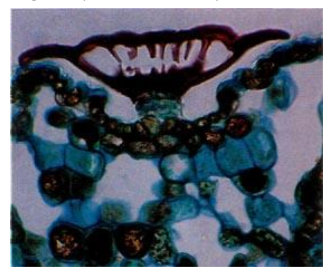
Cross-section view of the leaf scale at 300x. It reminds me of a glass compote dish (below).