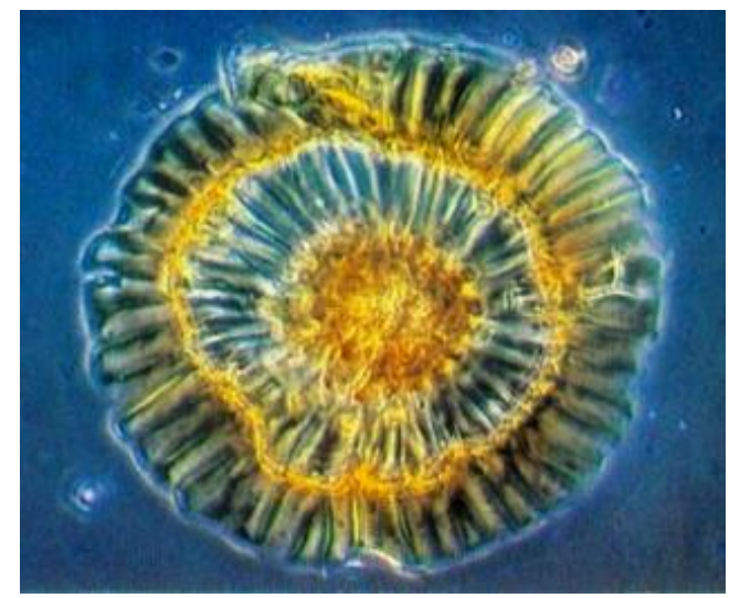
Top view of a rhododendron leaf scale at 300x

Botanists characterize lepidote rhododendrons by the presence of glandular leaf scales on various parts of the plant, mostly on the undersides of leaves. In this context scale means part of a leaf pore or stomata, and not the pesty scale insect. But what are these leaf scales that botanists talk about? I can truthfully say I have never seen one of these glandular leaf scales to know what it was. So, I went searching for pictures and I found pictures in a 1983 JARS article entitled "The Rhododendron Leaf Scale" by Clifford Desch, Jr. But the pictures were all taken with microscopes and were of structures 10 mils in diameter (.01 inches). That is about 4 times the size of a human hair, or about the size of the period at the end of this sentence. Scales are more obvious when they are dark, but sometimes they are green and blend in with the leaf. Here is what a scale on R. carolinianum looks like with a microscope from the top on the scale and in cross section on the right.