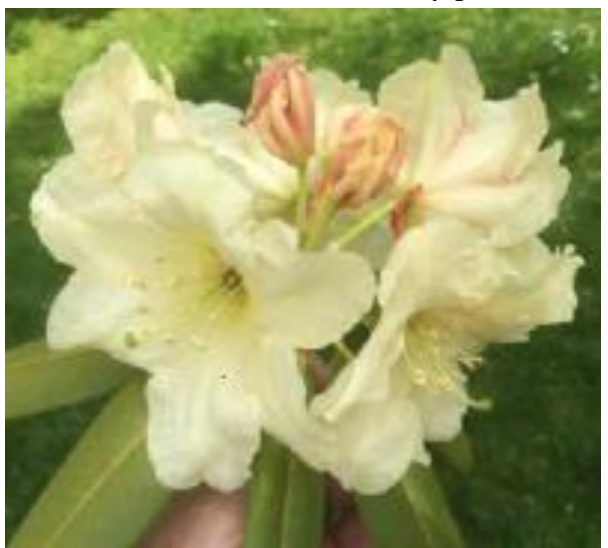
'Fashion Plate' of Becales

Unfortunately, gardeners in general don't find these beauties at the nurseries they patronize.