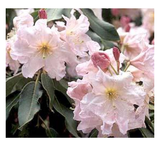
Elepidote Rhododendron: 'Dexter's Honeydew'

Rhododendrons of the Year for all 8 regions are announced in the JARS each year. Those selected for the Mid-Atlantic Region in 2021 are: