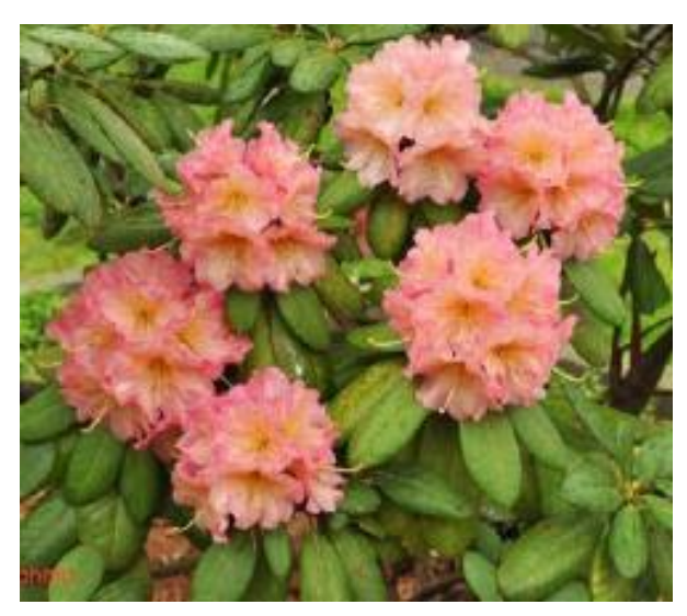
'Cause of Our Joy' of Minahan

The selection committee will have to work expeditiously, since many of the cultivars will have to be propagated and grown to planting size. Current plans are for the first set of roughly 40 cultivars to be planted in groups of three. Planting will take place in a plot