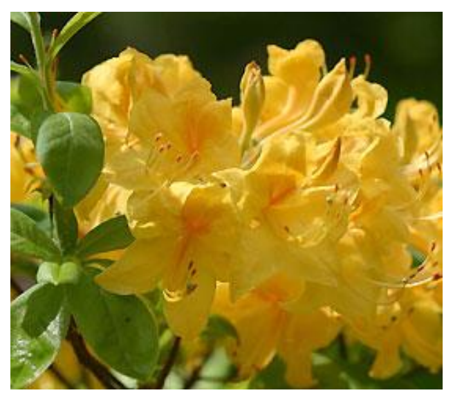
Deciduous Azalea: 'Aromi Sunstruck'

Flower very pale purple at margins, fading to greenish white at center and a light yellow throat, openly funnel-shaped, wavy-edged, 3\frac{1}{3} " - 5\frac{1}{4} " across. Ball-shaped trusses hold 7-10 flowers. Blooms midseason. Leaves narrowly oblong, 3" to 4\frac{3}{4} " long, flat, acute apex, cuneate base, wavy margins. Spreading plant habit, grows wider than tall. Typical height: about 4 ft. in 10 years. Plant and bud hardy to -5°F (-21°C). Hybridized by Dexter.