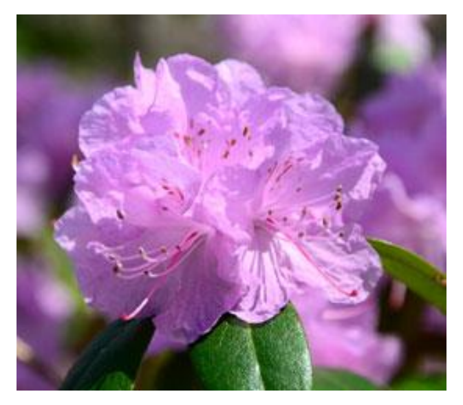
Lepidote Rhod.: 'Oritani'

Flower pink, funnel-shaped, 2" across. Truss holds 2-5 flowers. Blooms early midseason. Leaves elliptic to narrowly obovate, mucronate apex, cuneate base, 3" long, moderately glossy. Dense growth habit. Grows to an approximate height of 4 ft. in 10 years. Cold hardy to -25°F (-32°C). Hybridized by Theum.