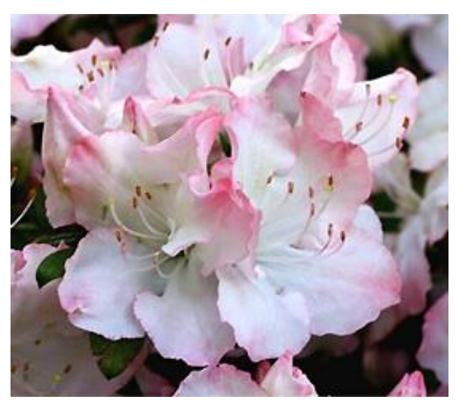
Evergreen Azalea: 'Quakeress'

Flower pink, funnel-shaped, 2" across. Truss holds 2-5 flowers. Blooms early midseason. Leaves elliptic to narrowly obovate, mucronate apex, cuneate base, 3" long, moderately glossy. Dense growth habit. Grows to an approximate height of 4 ft. in 10 years. Cold hardy to -25°F (-32°C). Hybridized by Theum.