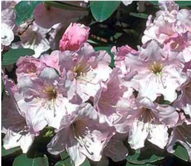
Elepidote Rhododendron: 'Cadis'

Flower light pink, flushed yellow, 3½" to 5" across, wavy-edges, fragrant. Held in flat trusses with 9-11 flowers. Blooms late midseason. Leaves 2¾" long, light green. Dense, spreading habit. Typical height: 5 ft. in 10 yrs. Plant is hardy to -15°F (-26°C). Hybridized by Gable.