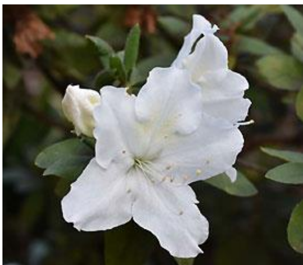
Evergreen Azalea: 'August to Frost'

Rhododendrons of the Year for all 8 regions are announced in the JARS each year. Those selected for the Mid-Atlantic Region in 2023 are: