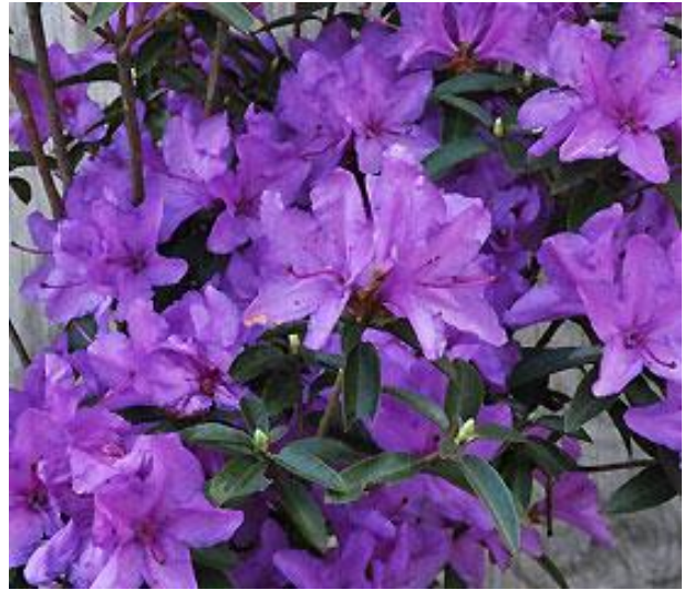
Lepidote Rhododendron: 'April Rhapsody'

Flower light pink, flushed yellow, 3½" to 5" across, wavy-edges, fragrant. Held in flat trusses with 9-11 flowers. Blooms late midseason. Leaves 2¾" long, light green. Dense, spreading habit. Typical height: 5 ft. in 10 yrs. Plant is hardy to -15°F (-26°C). Hybridized by Gable.