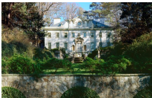
Swan House in the Atlanta History Center

The Atlanta History Center has a rhododendron and azalea dell originally developed by the Azalea Chapter ARS. Piedmont Park began as a fairground for expositions in 1887.