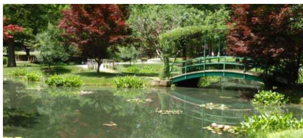
The Monet Bridge is in Gibbs Garden

Friday’s tour centers on the Gibbs Gardens, a 300-acre residential estate garden in the foothills north of Atlanta. The property boasts a spring-fed stream surrounded by ferns, native azaleas, dogwoods, and mountain laurels to which have been added Japanese maples, oaks, hollies, rhododendrons, and 16 gardens including the Japanese and Waterlily Gardens, Manor House Gardens, Inspiration Gardens (azaleas and conifers), Rose Gardens, Butterfly Gardens, and Wildflower Meadow.