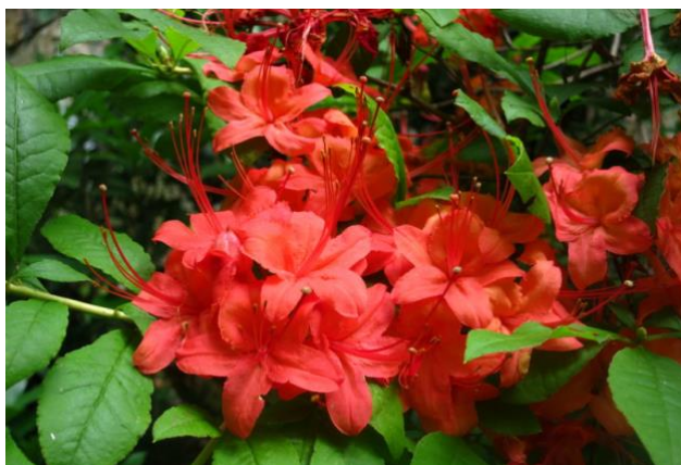
R. prunifolium, Georgia’s state wildflower

The 2023 ARS/ASA Joint Convention is being held in Atlanta, Georgia Wednesday, 19 April to Sunday, 23 April. It is a city of parks. We love flowers here. The native azalea is our state wildflower, and Georgia is proud to have 12 species of azaleas growing naturally within the state, more than any other state.