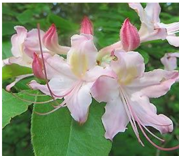
Deciduous Azalea: R. colemanii

Flower white with a pale yellow-green blotch, broadly funnel-shaped, single, 2½" across, wavy edged lobes. Occasionally flowers have strong reddish purple stripes and sectors, or a prominent red/violet blotch, some with strong reddish purple selfs. Blooms continuously but sparingly on current growth from late summer to first hard frost. Leaves elliptic, broadly acute apex, cuneate base, 2" long, flat, semi-glossy, moderate yellowish green, with brownish orange hairs above and below. Grows to a typical height of 2 feet in 10 years. Plant hardy to at least -10°F (-23°C). Selected by Matlack.