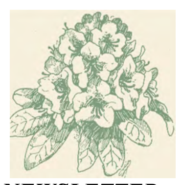
NEWSLETTER April/May/June 2012