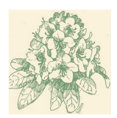
NEWSLETTER March/April 2013