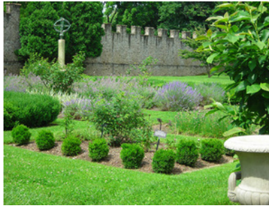
15. Highlands Mansion/Garden

Du Pont estate & Gardens on 235 acres near Wilmington along the Brandywine Creek