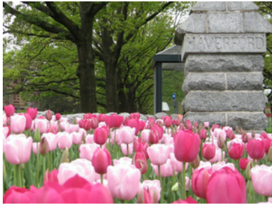
12. Haverford Col. Arboretum

World famous du Pont 926-acre gardens and conservatory near Kennett Square, PA.