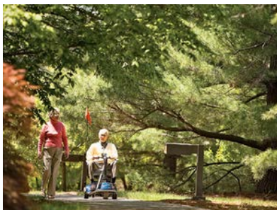
4. Barton Arboretum

The oldest botanic garden in America on the west bank of the Schuylkill, 46 acres. Phila.