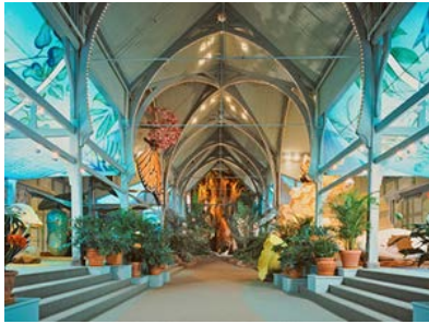
22. Philadelphia Zoo

A 197-acres of native plants featuring a 55-acre arboretum in Northern Chester County, PA.