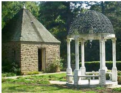
27. Tyler Formal Gardens

300 acres on the Swarthmore College Campus with 4,000 kinds of ornamental plants.