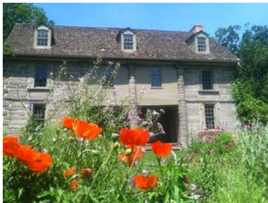
3. Bartram's Garden

A 12-acre arboretum with over 3,000 species of woody plants and trees in Merion, PA.