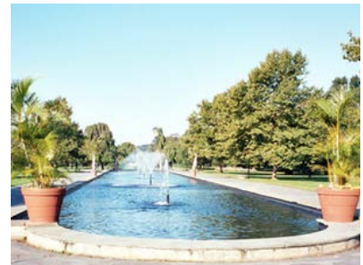
9. Centennial Arboretum

A garden-based theme park adjacent to the Camden Aquarium near the RiverLink.