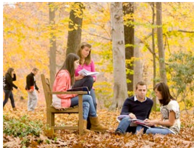
7. Cabrini College Campus

Brandywine Conservancy's Wildflower and Native Plant Gardens at Chadds Ford, PA.