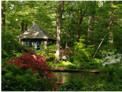
2. Barnes Foundation

A 55-acre natural historic landscape in the historic Germantown section of Phila.