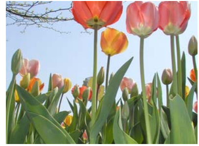
8. Camden Children's Garden

A 112-acre estate in Radnor landscaped by Frederick Law Olmsted in the early 1900's.