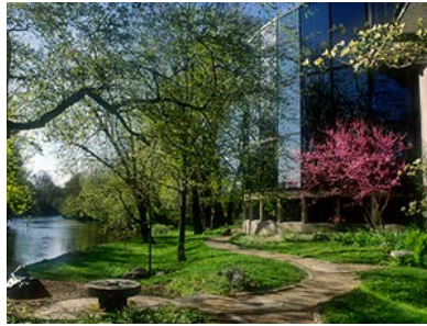
6. Brandywine River Museum

A 134-acre wildflower preserve in Bucks County near New Hope, PA.