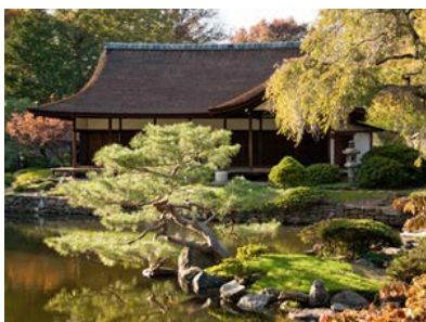
24. Shofuso Japanese Garden

In Germantown, from the 1820's. It is the oldest original rose garden in America.