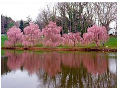
14. Henry Schmieder Arboretum

500 acres devoted to native plants with 50 acres of display gardens near Wilmington, DE.