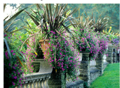
19. Morris Arboretum

100-acre 18 th century nursery and farmstead with 30 acres of gardens in Bucks County.