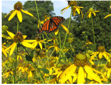
5. Bowman's Hill

Over 200 acres near Medford, NJ, including a nature preserve and gardens.