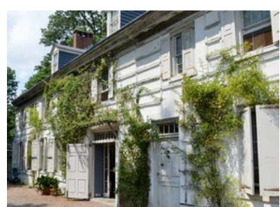
30. Wyck Rose Garden

On an acre at the Bucks County Comm. College are 4-tier classical gardens.