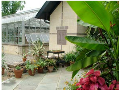
25. Temple University Ambler

3,000-acre du Pont estate and formal gardens with fountains in Wilmington, DE.