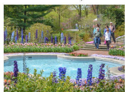
20. Mt. Cuba Center

46 acres of native trees in Devon, PA, featuring collections of rhododendrons and azaleas.