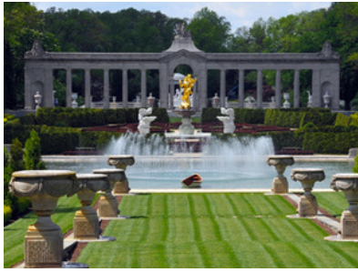
21. Nemours Mansion/Gardens

3,000-acre du Pont estate and formal gardens with fountains in Wilmington, DE.