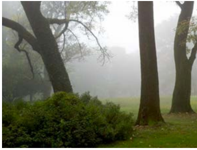
1. Awbury Arboretum

A 55-acre natural historic landscape in the historic Germantown section of Phila.