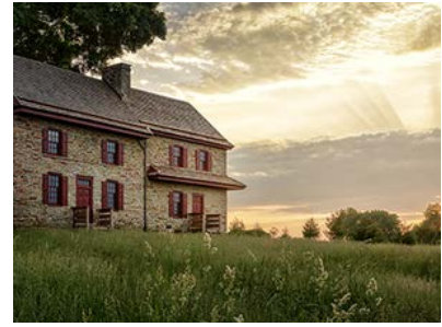
18. Longwood Gardens

44-acre country estate with a mansion and a 2-acre formal garden in Whitmarsh, PA.