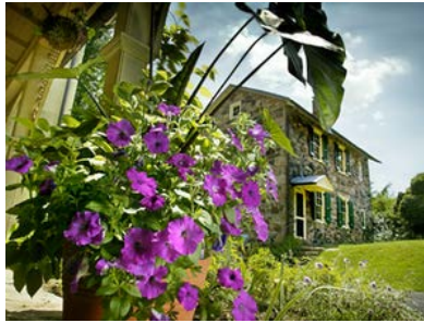
26. Tyler Arboretum

America's first zoo, a 42-acre Victorian garden, is home to more than 1300 animals.