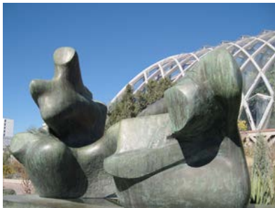
13. Henry Botanic Garden

University of Pennsylvania's 92-acre garden and arboretum in the Chestnut Hill section, Phila.