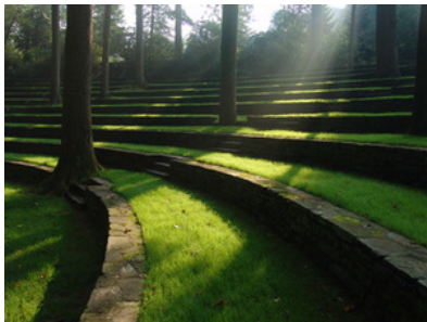
23. Scott Arboretum

Near Wilmington, DE, its 60-acre naturalistic garden is among America's best.