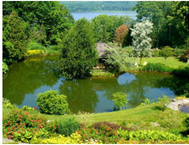
16. Hortulus Farm Garden

216-acre English pastoral landscape created by William Carvill in 1833, Haverford, PA.