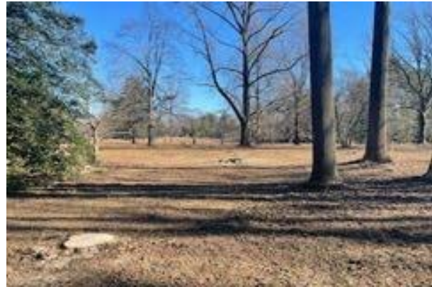
Site at Tyler Arboretum after tree removal

"We are seeking nominations from the hybridizers themselves, from anyone growing the plant or a clone, or even if you have a neighbor who is