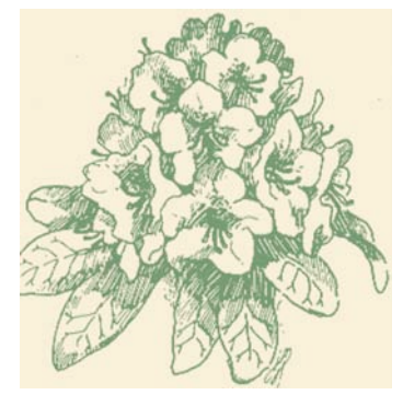
NEWSLETTER August/September 2012