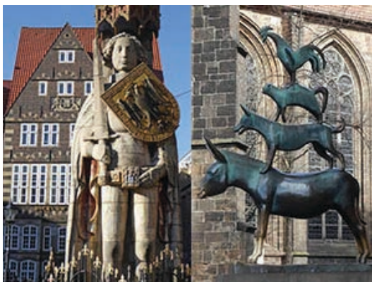
Roland and Bremen Town Musicians

* Those on the German Pre-Tour 2 receive a 70 € credit double, 140 € credit single for the night of May 13 when they sign up for the Danish-Swedish Pre-Tour 3. Early Bird Registration extends to November 15 th and is limited to ARS members.