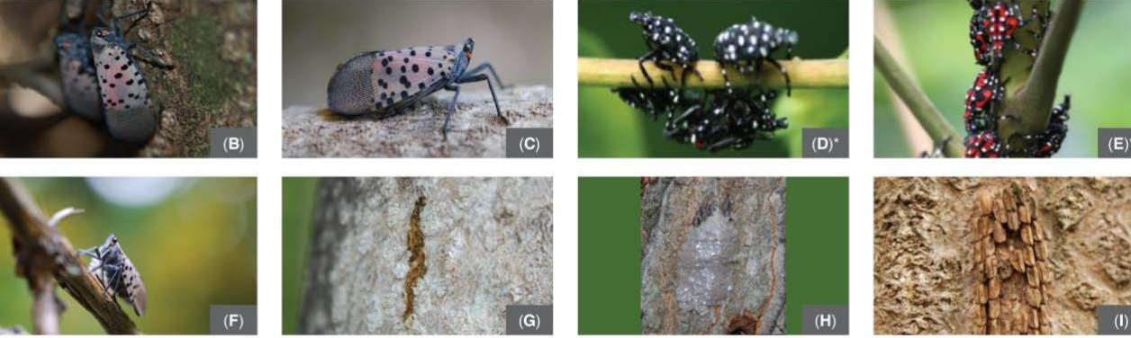
*Photos courtesy of Park et al. 2009, Biological Characteristics of Lycorma delicatula and the Control Effects of Some Insecticides.

Visit <u>www.agriculture.pa.gov</u> to access the "Spotted Lanternfly Quarantine Checklist" or contact a local municipality or extension office.